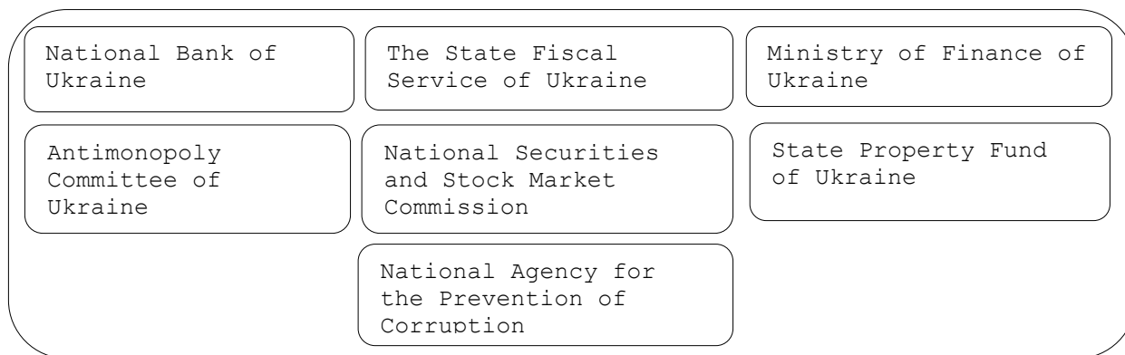
Fig. 2. Interaction of the National Commission on Securities and Stock Market with other state bodies *