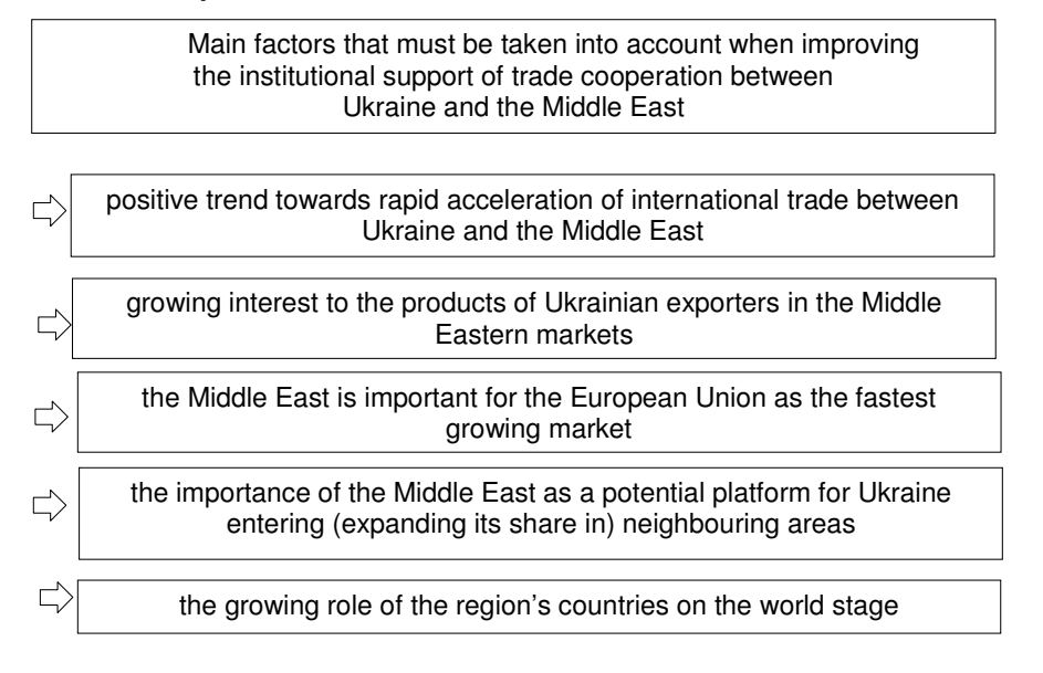
Figure 5 Main factors to take into account when improving the institutional support of trade cooperation between Ukraine and the Middle East

The next step can involve the creation of a system of priorities to be used as a guide when shaping the strategy for promotion of Ukrainian producers in the Middle Eastern markets. Namely: